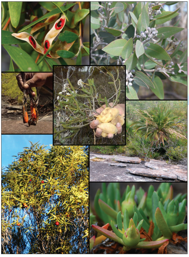
Figure 2 (Clockwise from top left), seeds of Acacia cyclops, eaten by south coast Noongars; Djuljuruk (Eucalyptus pleurocarpa), a marker of country for south coast Noongar families; Macrozamia dyeri, of which the seeds (pauyin) were eaten, adjacent to lizard traps on granite inselberg east of Esperance; Pain, fruit of Carpobrotus modestus; Wonyill, fruit of Santalum acuminatum, Quadin, rhizomes of Haemodorum discolor; Joowaq, tubers of Platysace deflexa (centre).

That particular resources and habitats were protected from fire in Noongar country is clearly apparent in early colonial